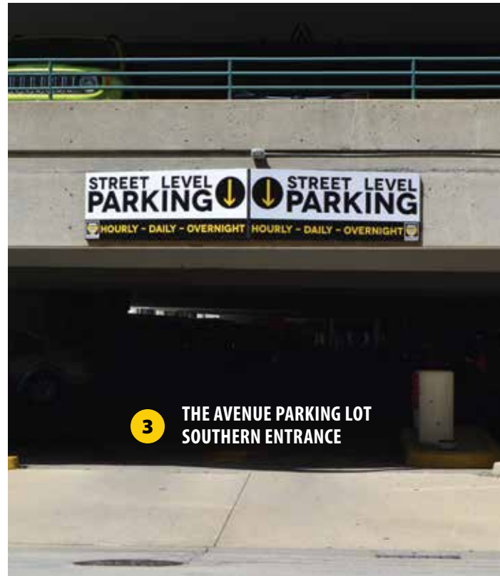
3 THE AVENUE PARKING LOT SOUTHERN ENTRANCE