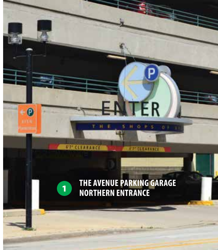
1 THE AVENUE PARKING GARAGE NORTHERN ENTRANCE