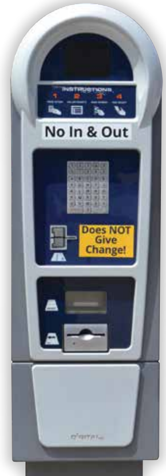
Pre-pay by license plate pay station